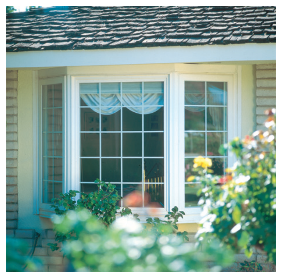
Bay window with casement "flankers" for full-height ventilation when open.