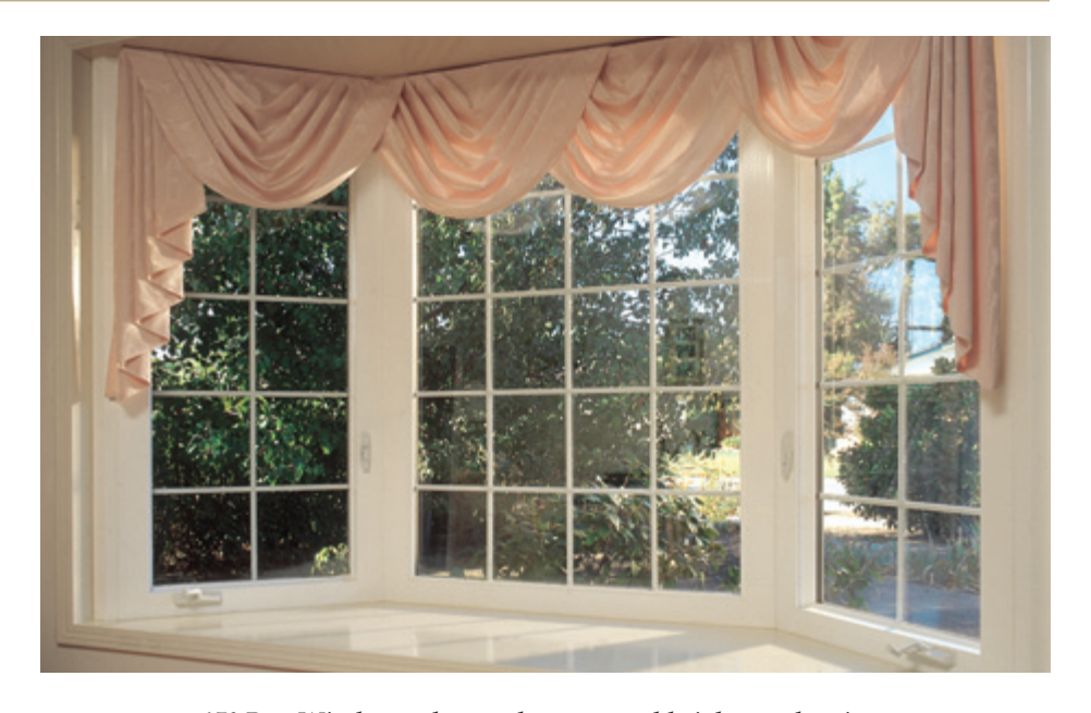
45° Bay Window enlarges the room and brightens the view.