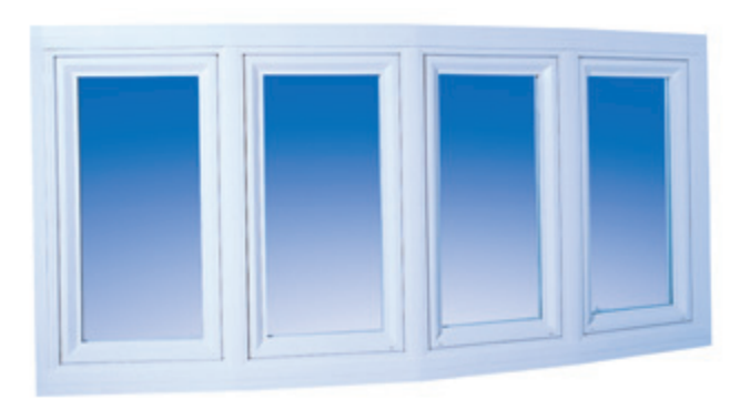
4 Lite Bow Window with fixed casement center lites provides a uniform look across the whole window.