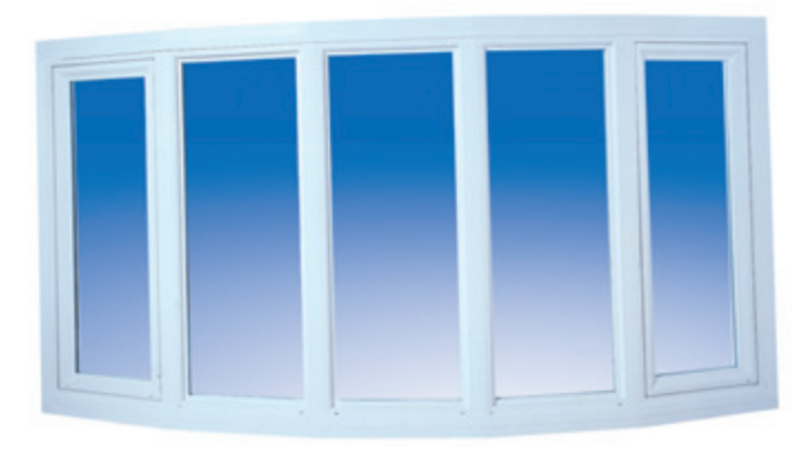
5 Lite Bow Window with picture window center lites offer maximum view area.